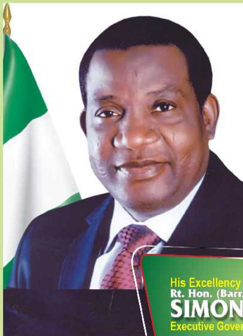
His Excellency Rt. Hon. (Barr.) SIMON B. LALONG Executive Governor, Plateau State