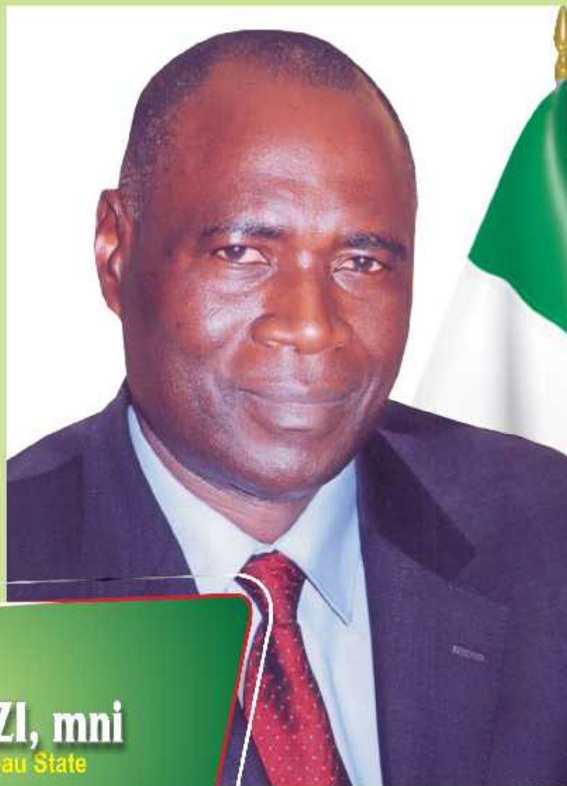
IZAM ATANG AZI, mni Head of Civil Service, Plateau State