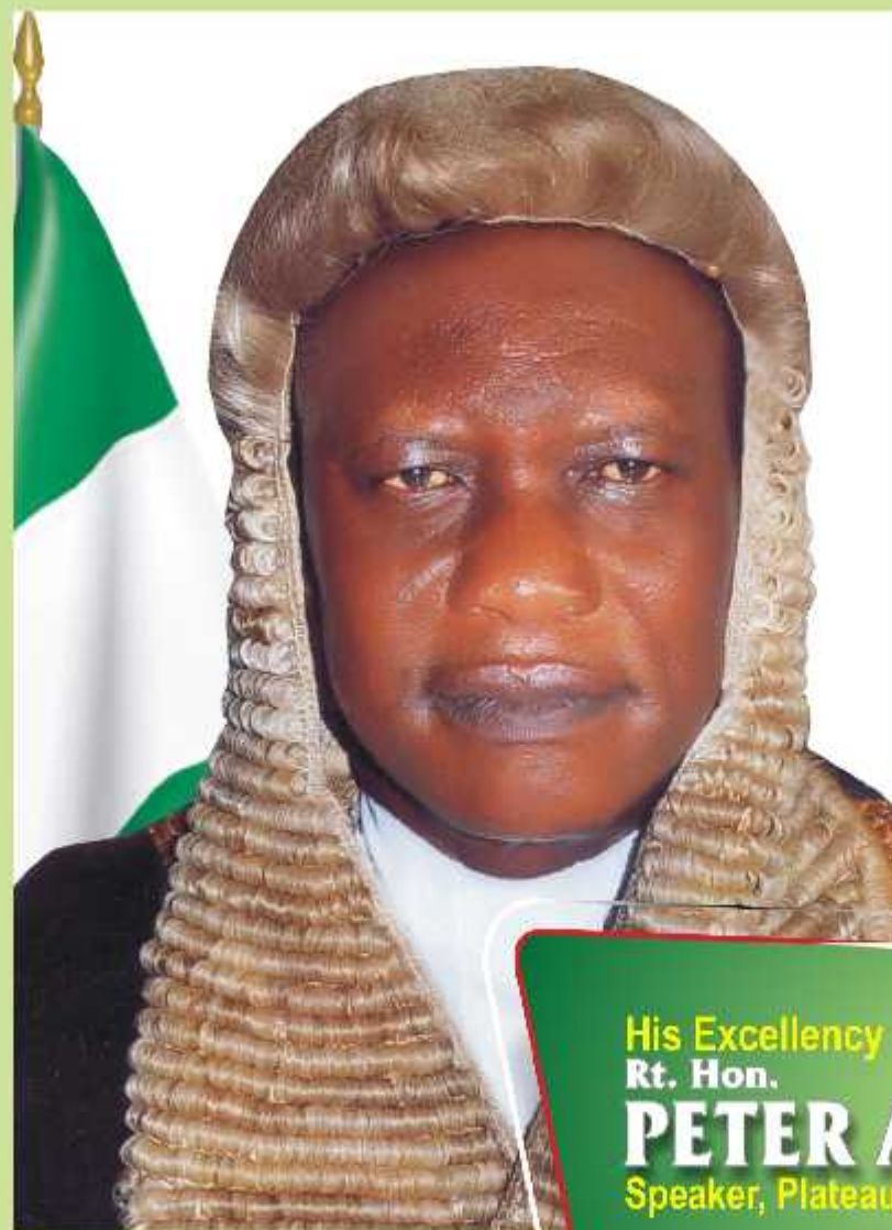
His Excellency Rt. Hon. PETER AJANG AZI Speaker, Plateau State House of Assembly